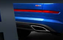
Special RS rear bumper, exhaust system's visible tailpipes and RS-specific reflector