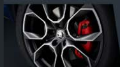
20-inch Xtreme alloy wheels with 17-inch brakes