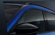
Gloss black details: Wing mirrors, window frames and roof rails